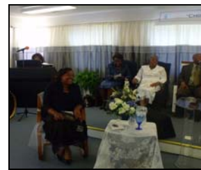
First Day Lady continued pg 4

Next on the program came an opportunity for saints and friends to share recollections on experiences shared with the First Lady.