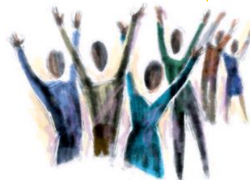
Praise the Lord

"A spirit of praise overwhelmed me and the Lord gave me a Word... Praise Ye the Lord!"