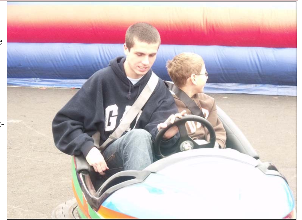
Local community members enjoy the bumper cars during HTC's Annual Hallowed Ones Day

Even a forecast of scattered showers couldn't deter the youth – or their equally excited parents – from the prospect of test driving bumper cars, performing acrobatic feats in the moon bounces or winning stuffed animals and