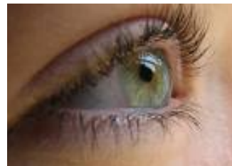
Worrying about what others do hinders the work that needs to be done in you.

Point your finger to yourself and ask Jesus to examine YOUR soul today.